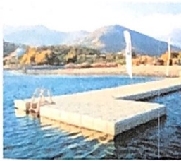
BEACH RESORT FLOATING DOCKS

Cutting-edge design, reinvented elegance: The best way to enhance your landscape and improve safety.